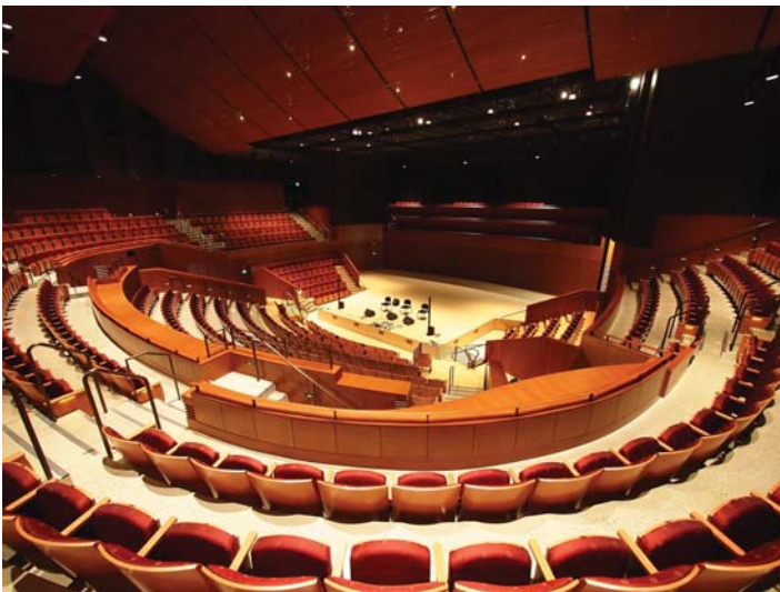
Inside the Hall: Thrust Configuration