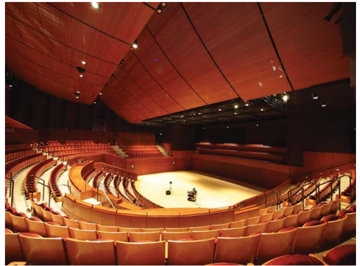
Inside the Hall: Concert Configuration