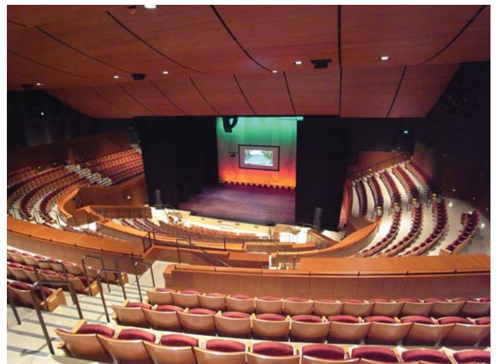
Inside the Hall: Semi Proscenium Configuration