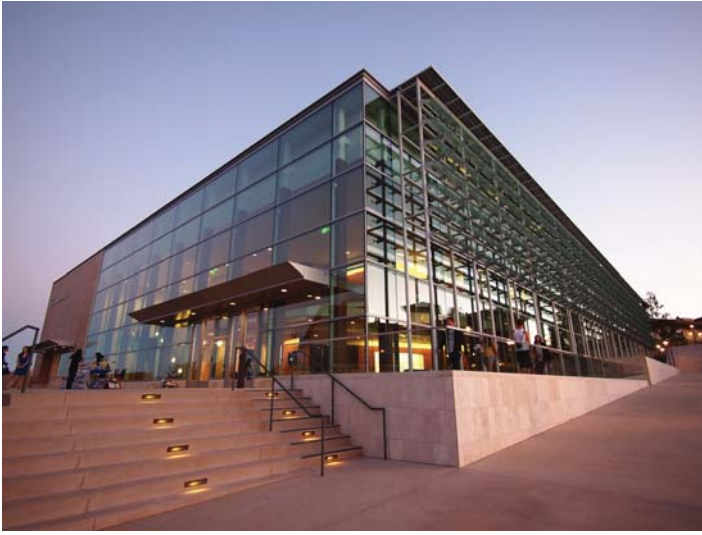
Soka University Performing Arts Center